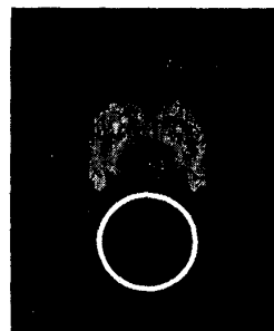
Figure 1: caudate nucleus, putamen, and background ROIs drawn on a reconstructed slice and used for the assessment of quantitative accuracy.

Neither scatter correction alone, nor attenuation correction alone, nor combined scatter and attenuation corrections improved spatial resolution substantially in the reconstructed slices (maximum change less than 2 mm) (Table 1). Spatial resolution was only substantially improved when performing the FDP collimator response correction: this correction improved spatial resolution by almost 8.6 mm as compared to